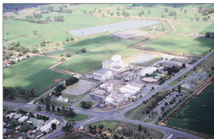
Dairy centre: Fonterra's Stanhope factory.

"This is our third highest full-year price on record, so it's a strong finish and we are pleased to maintain our track record of offering suppliers very competitive farmgate